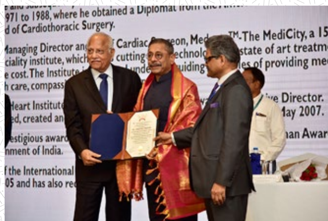
Dr. Naresh Trehan (Gurugram)