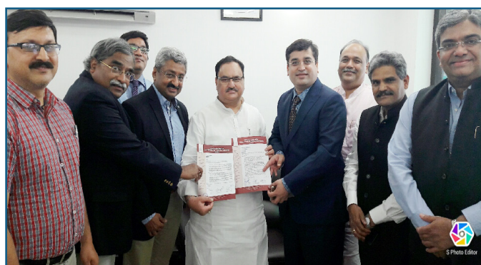
Executive Committee meeting with Honorable Health Minister Shri J P Nadda Ji

The winner of the award paper session will be sponsored by IACTS to participate in an overseas conference. The second and third runners up will be sponsored to participate in the next annual conference of IACTS.