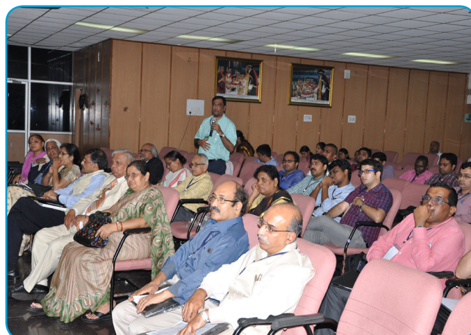
Section of the audience