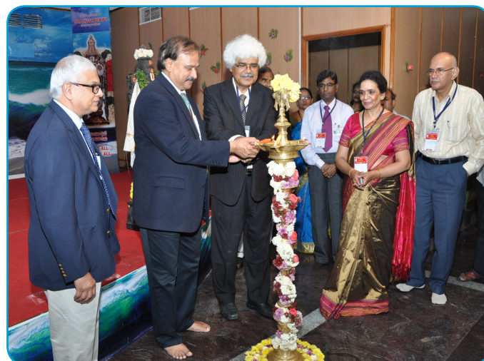
Inauguration of the IACTS Midterm Thoracic CME

The IACTS Midterm Thoracic CME was held at Sri Venkateswara Institute of Medical Sciences (SVIMS), Tirupati, Andhra Pradesh, on 21 & 22 November 2015. The Chancellor of SVIMS University, Honorable Chief Minister, sent an enlightening message for all the postgraduates and the delegates. Sixty eight postgraduates and seven delegates from various parts of India participated in the CME.