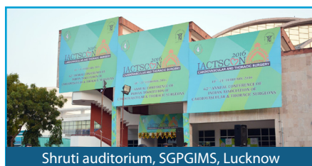
Shruti auditorium, SGPGIMS, Lucknow