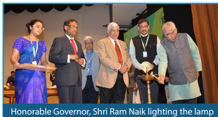
Honorable Governor, Shri Ram Naik lighting the lamp

The lecture theatre complex and Shruti auditorium at SGPGIMS had adequate conference facilities including spacious conference halls, meeting rooms and banqueting facilities on site as well as in the hobby center lawns. State-of-the-art audio-visual equipment with dedicated preview zones and technical support was arranged for effective presentation of all the sessions.