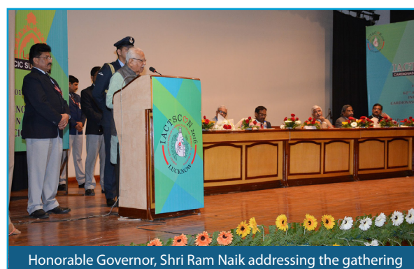
Honorable Governor, Shri Ram Naik addressing the gathering