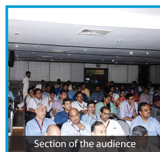
Section of the audience