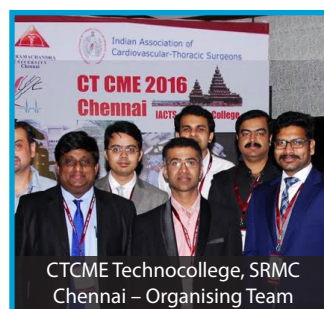
CTCME Technocollege, SRMC Chennai – Organising Team

The CTCME 2016 was held at the Harvard Auditorium, Sri Ramachandra Medical University, Chennai on 20 & 21 August, 2016. The CME was very program specific, well synchronised and had all the major topics and trending techniques presented by the best of the experts in the field of cardiothoracic surgery. There were special sessions to address the basic concepts in cardiothoracic surgery including clinical case discussions and the surgical video presentation. The conference surely has increased the competitive and professional advantage of the young experts in the field. We had 135 post graduates and 55 delegates who actively participated in the CME.